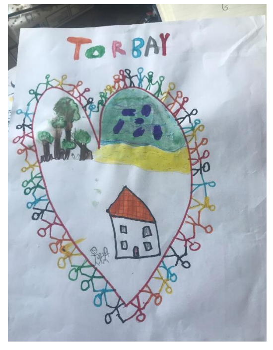
An hand-drawn image of what Torbay means for one of our cared for children.

- Cared for young person, specific consultation session